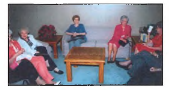
\uparrow Early arrivals for the luncheon enjoy a visit.