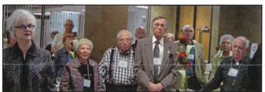
†Academy Luncheon group joins in singing "God Bless America"