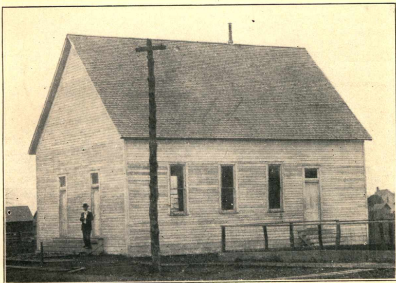
FIRST INDEPENDENT HOLINESS CHURCH IN TEXAS VAN ALSTYNE, TEXAS