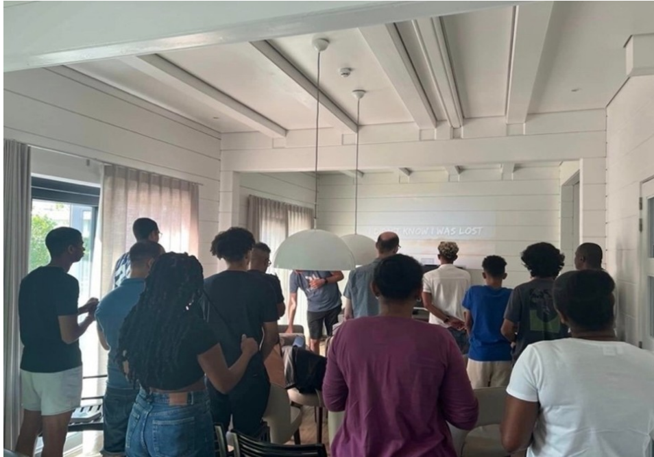
The Church of the Nazarene gathers in Luxembourg

Good reports are coming out of the relatively new work in the small European country of Luxembourg. The committed congregation and its leaders, along with missionary support presence, are reaching out into a highly secularized society with the Good News of Jesus and the hope He brings through the life He offers.