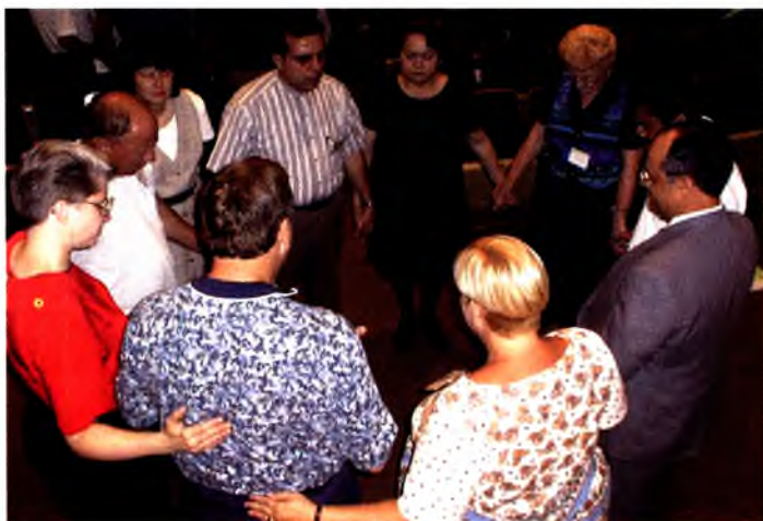
Nazarenes praying for reconciliation and unity within the Body of Christ.