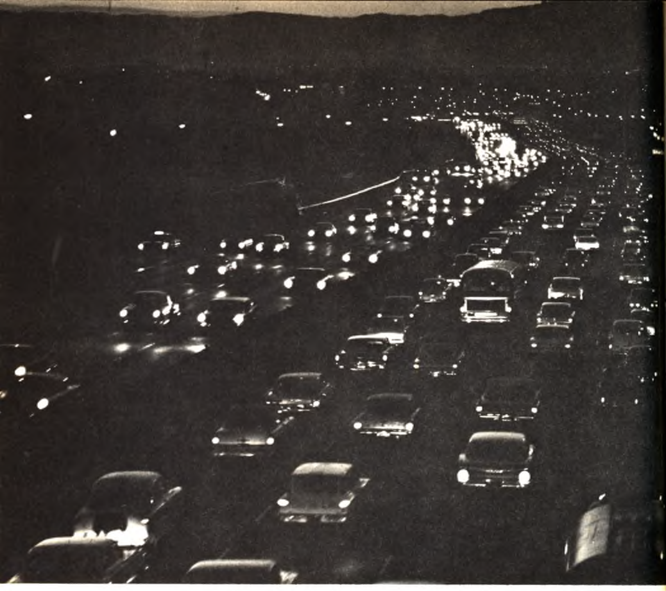
Freeway life offers a good opportunity to test your religion