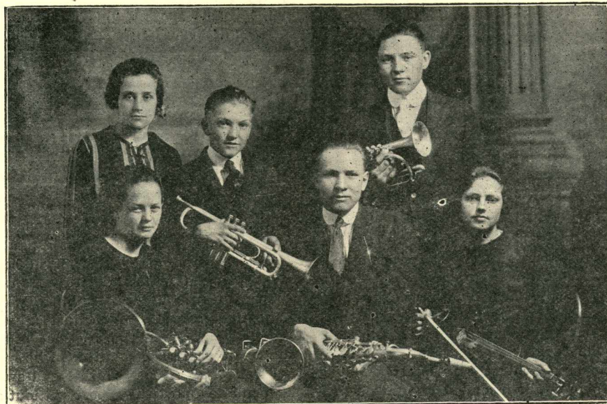
OUR GRAMMAR SCHOOL ORCHESTRA