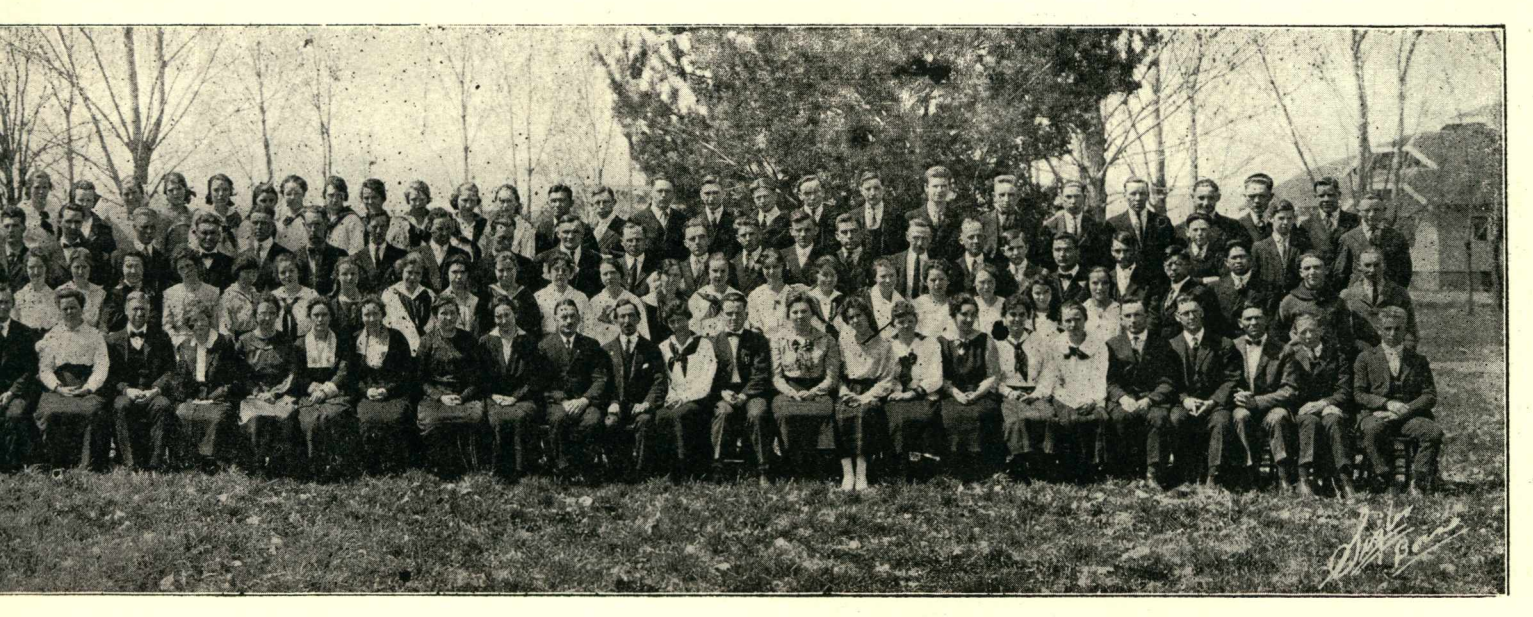
ulty of Northwest Nazarene College

our other interests such as our Publishing House and our schools which are in need of strong financial support. With out the churches these can not run.