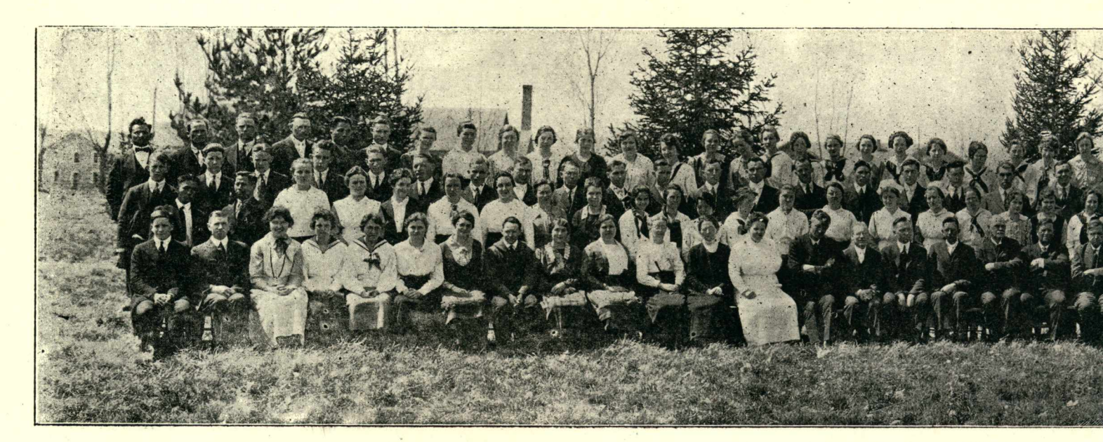
College, Academy, Bible Students and