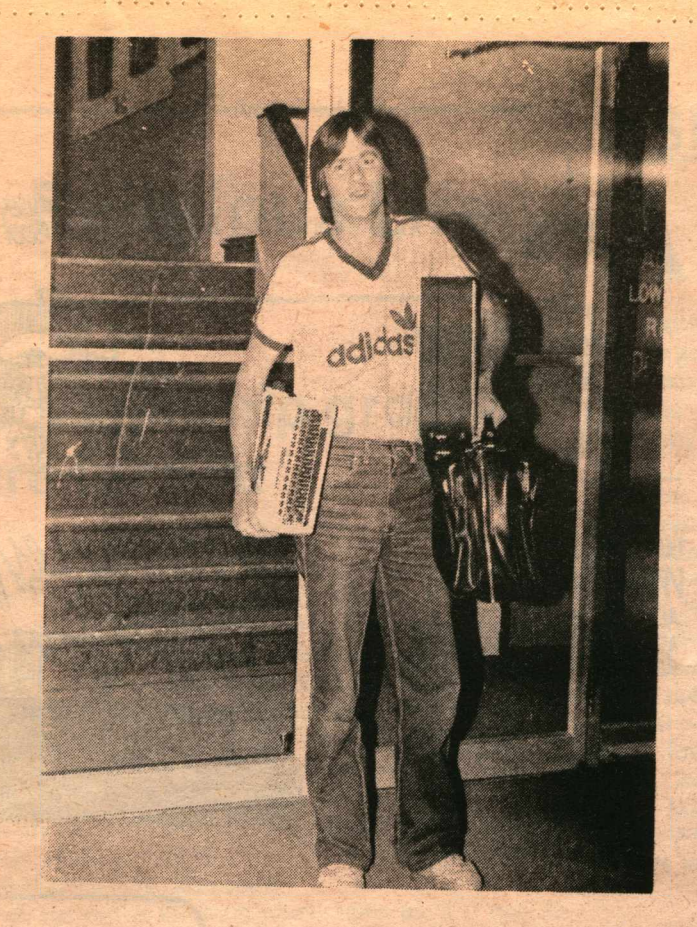
"One week I might be in Nampa, the next in Cheyenne or wherever."

"One week I might be in Nampa, the next in Chevenne, Wyoming, or wherever. I'll take a job wherever I can because I want to travel. The bottom line is I'm young, energetic and I can go wherever I want." PER SALE ARRESTS