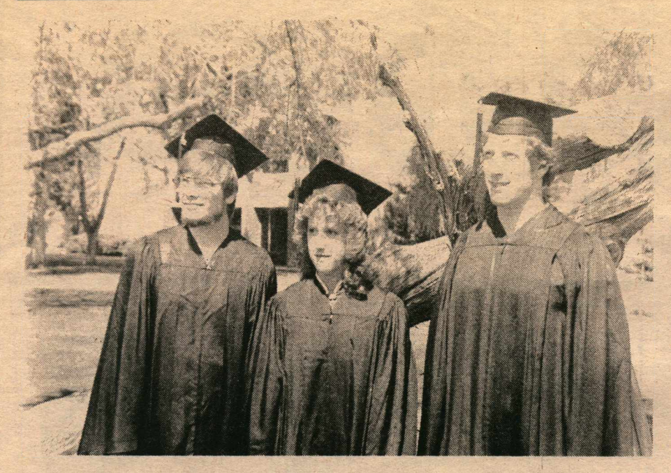
Seniors prepare for graduation