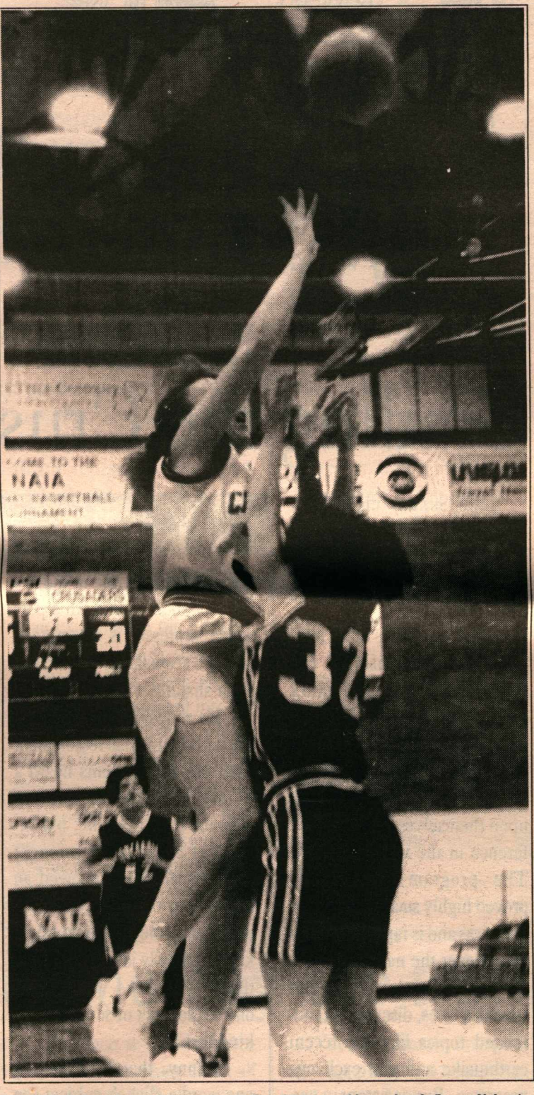
The Lady Saders dropped two games to Top 25 teams this weekend.