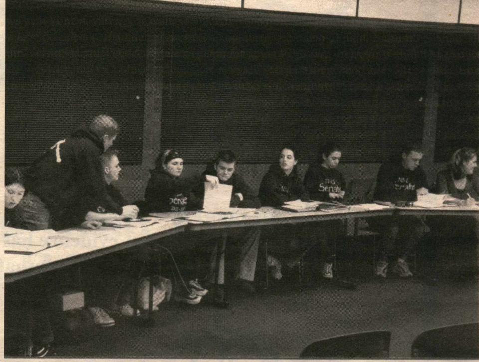
Weekly Senate Meeting takes place in Wordsworth

Budgeting is a hectic time of year for many involved in student government.